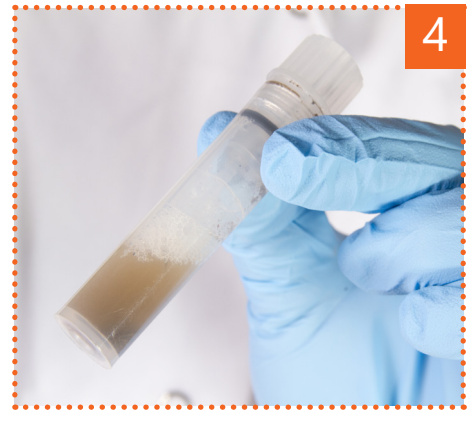
■ Shake the sample tube to homogenize well.