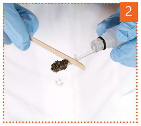
■ If faeces are solid, remove the excess amount using a spatula.