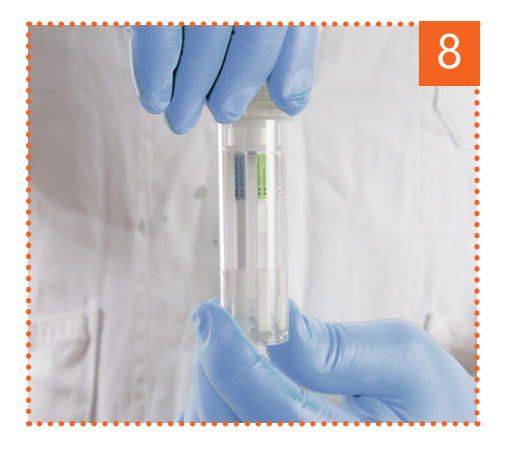
Screw the top of the strip tube.

You must hear two separate clicks, for perforation of superior and inferior septa of the sample tube.