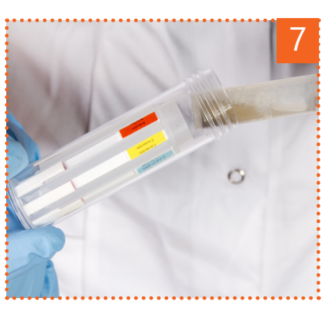
Insert the sample tube into the strip tube.