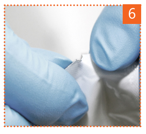
■ Tear the aluminium envelope open at the notch. Once the device has been taken out of the envelope its stability is of short duration, especially in a humid environment.