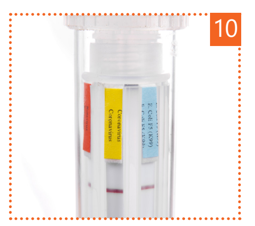
■ After 10 minutes, read the results using picture 11 as standard.

For Clostridium perfringens interpretation use picture 12.