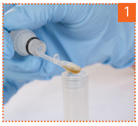
■ Take the faeces directly from the rectum of the piglet. If the samples are liquid, take a spoonful.