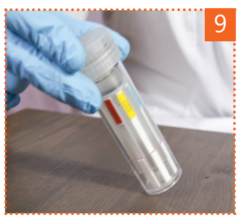
Sometimes, especially when the sample isn't homogenized, liquid migration can stop on one or more strips. In that case, tap the end of the strip tube on hard surface to allow migration to start again.

The liquid contained in the sample tube moves to the strip tube and slowly migrates along the strips.