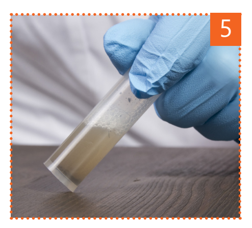
■ Tap the sample tube on a hard surface so that all the liquid is collected at the bottom of the tube.