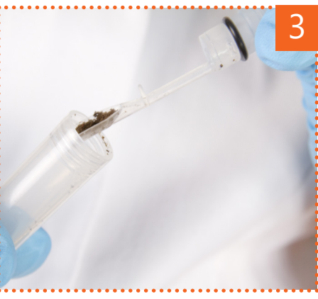
■ Dilute its content in the liquid of the small tube called sample tube.